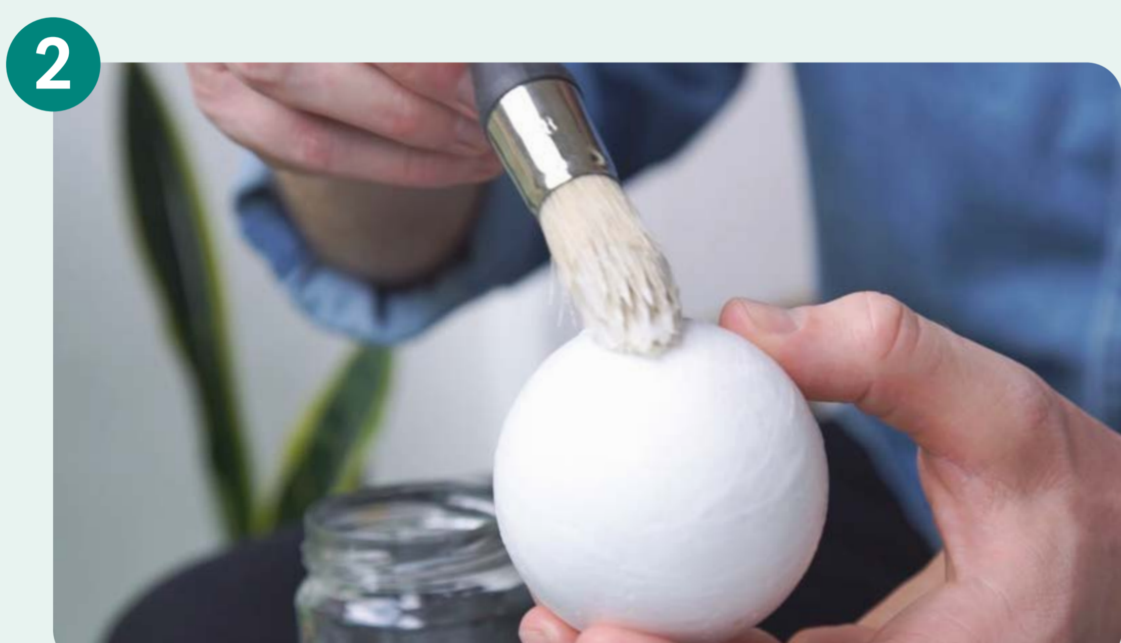
Lightly coat a styrofoam ball with the glue mixture.