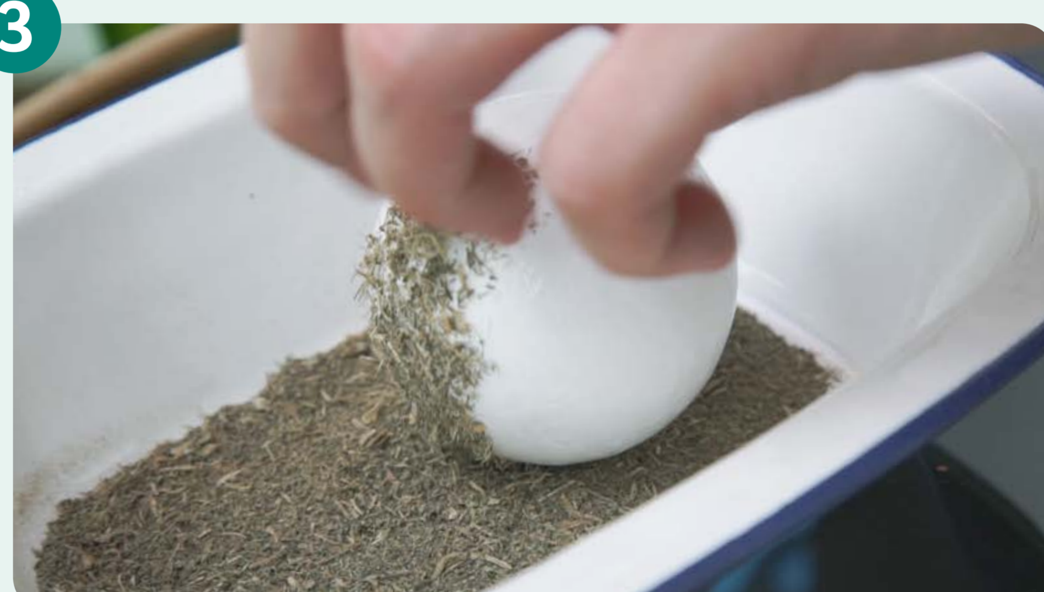
Coat the ball with catnip and set aside to dry.