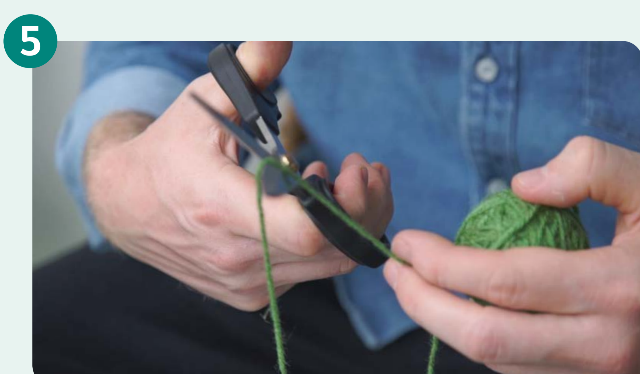
Cut the yarn and tuck the end into the ball.