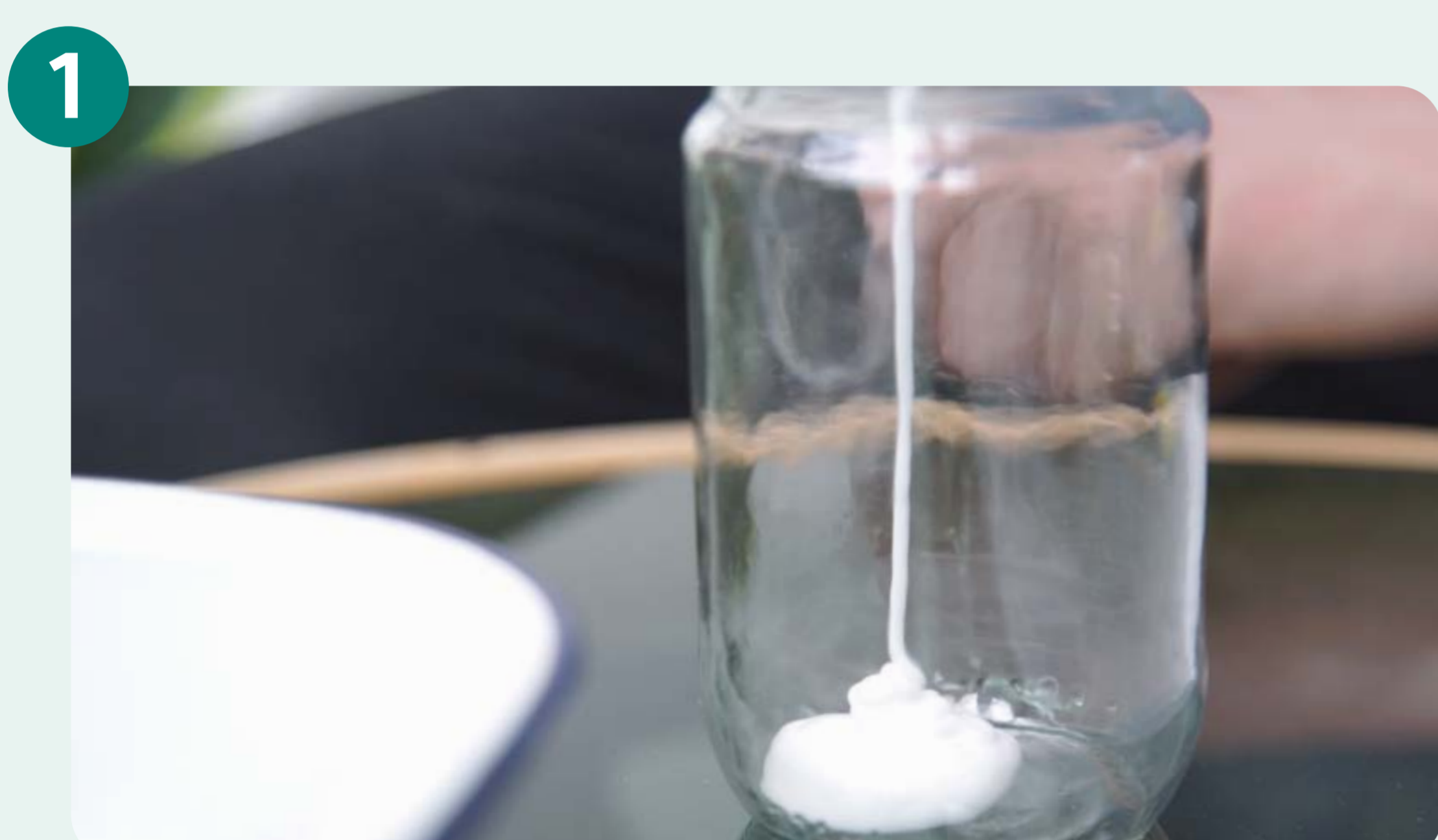
Mix 2 parts glue with 1 part water.